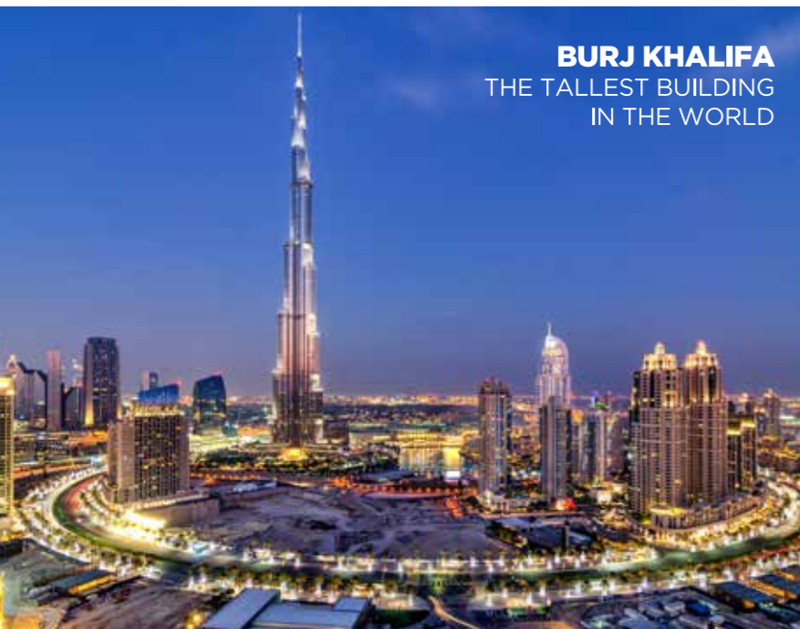
BURJ KHALIFA THE TALLEST BUILDING IN THE WORLD