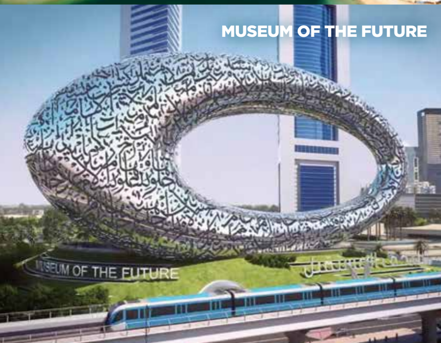
MUSEUM OF THE FUTURE