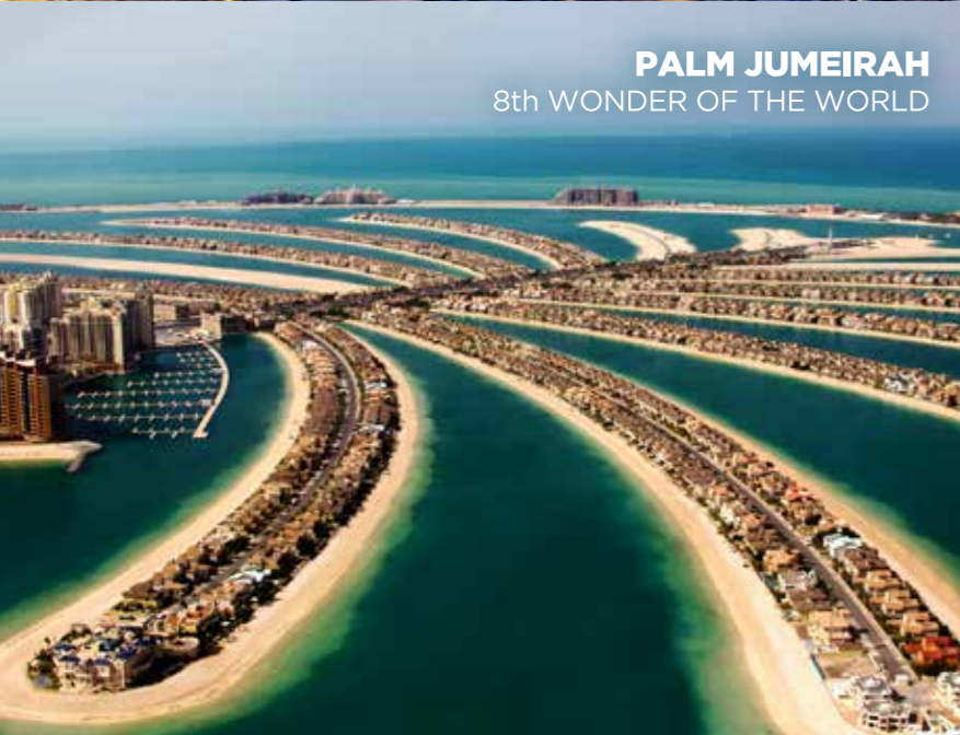
PALM JUMEIRAH 8th WONDER OF THE WORLD